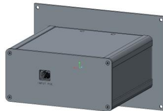
Rear face for NTP/POE version cable supplied: 3 m Ethernet CAT5E