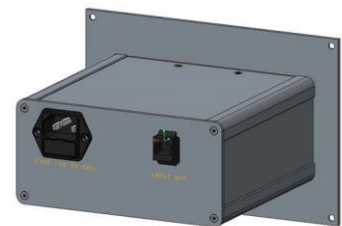
Rear face for NTP/230 VAC version and 2 m Power AC EU/IEC C13